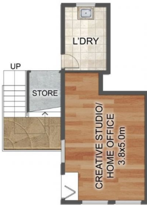
LOWER GROUND FLOOR PLAN