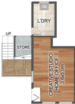
LOWER GROUND FLOOR PLAN