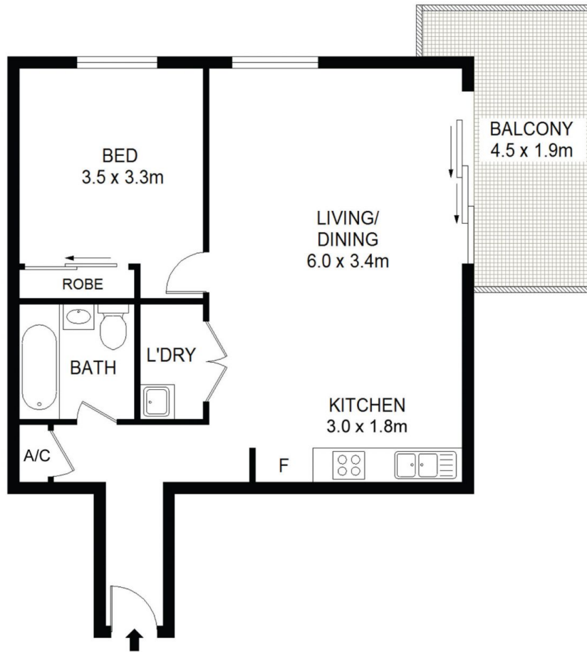
LEVEL 9 (FOYER 3)