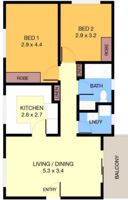
UNIT 12, LEVEL 3